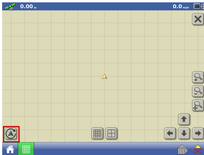
Figure 2 - Press center of map screen and heading change button will appear

When Heading Detection is disabled, the GPS heading will always be considered as forward.